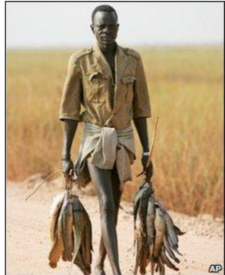
Life remains basic for many southern Sudanese

But he also blamed incursions by the Lord's Resistance Army - a feared guerrilla army originally based in Uganda but now marauding across several countries.